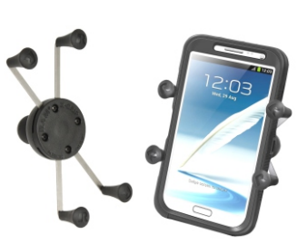
X-Grip™ IV - Large Phones & Phablets P/N: RAM-HOL-UN10BU

RAM Mounting Systems 8410 Dallas Ave S Seattle, WA 98108 Phone: (206) 763-8361 Faxww.rammount.com support@rammount.com