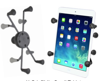
X-Grip™ II - Small Tablets P/N: RAM-HOL-UN8BU