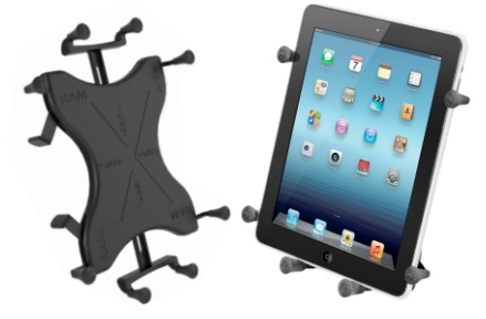
X-Grip™ III - Large Tablets P/N: RAM-B-202-UN9U