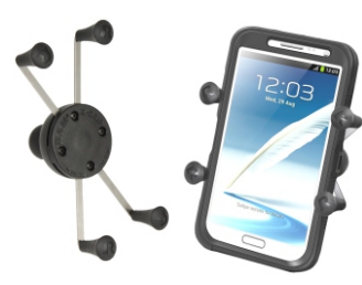
X-Grip™ IV - Large Phones & Phablets P/N: RAM-HOL-UN10BU

RAM Mounting Systems 8410 Dallas Ave S Seattle, WA 98108 Phone: (206) 763-8361 Fac: (206) 763-9615 www.rammount.com support@rammount.com