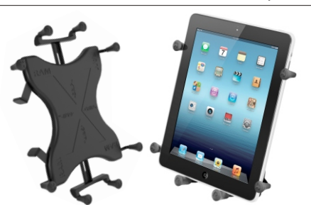
X-Grip™ III - Large Tablets P/N: RAM-B-202-UN9U