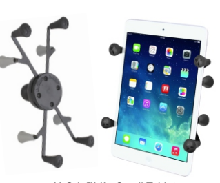
X-Grip™ II - Small Tablets P/N: RAM-HOL-UN8BU